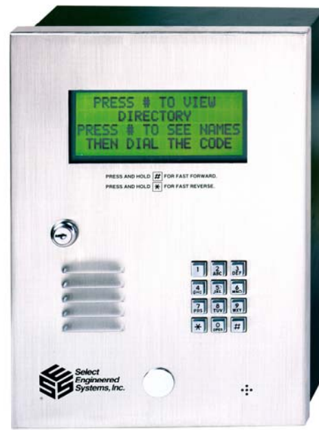
TEC 4 HF