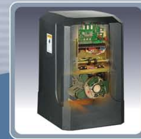
RAM 5100 UL Commercial Industrial