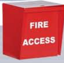
RAMSET Fire Box

Allows the fire department to open your gate in the case of an emergency.