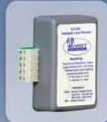
RAMSET ILD-24S Loop Detector

A safety device that stops the gate from closing on a vehicle.