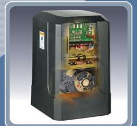
RAM 5200 UL Commercial Industrial