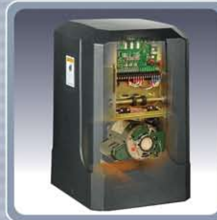
RAM 5000 UL Commercial Industrial