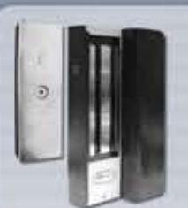
RAMSET Magnetic Lock

Allows the fire department to open your gate in the case of an emergency.