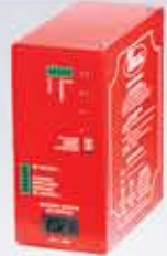
RAMSET BBS-Battery Back-Up System

A safety device that stops the gate from closing on a vehicle.