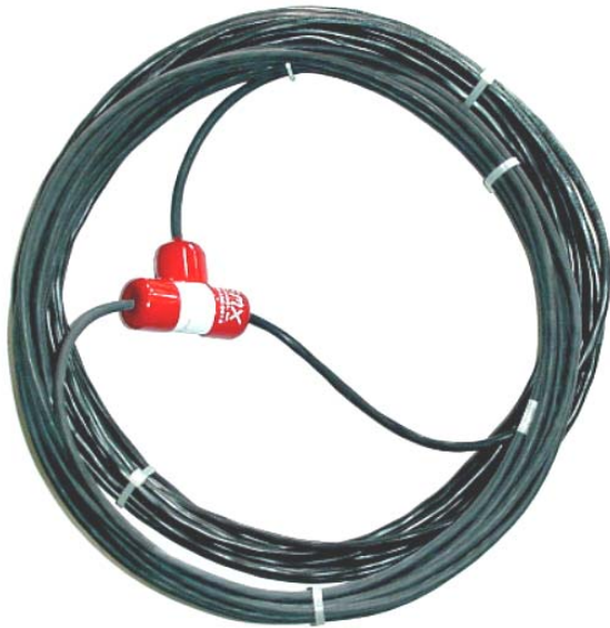
EMX LITE PREFORMED LOOP