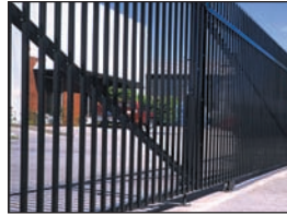
large gates up to 2000 Lbs