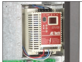
variable speed motor drive