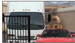
partial open open gate short distance for cars or open fully for trucks