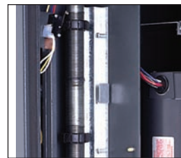
limit switches direct driven and easily adjustable