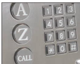
large scroll and call buttons