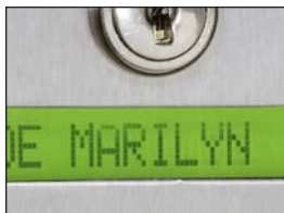
built-in display resident directory