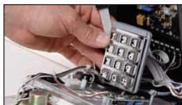
telephone access systems use a modular design concept that makes installation and service easy