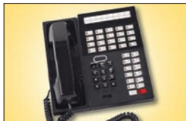
dtmf tone output allows these systems to be used with PBX, KSU and telephone systems with auto-attendants