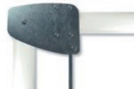
XBA11 Joint for bars XBA15 (from 76.8 to 94.5 inches).