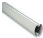
XBA5 White paint-finished aluminium bar 2.7x3.6x202.7 inches.