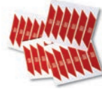
WA10 Red adhesive reflector strips.