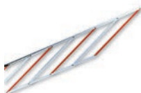
WA13 Aluminium rack up to 6.6 ft.