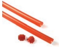
XBA13 Rubber impact protection strip. Length 3.3 ft.