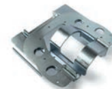
XBA10 Pivoting connection for bars up to 13.1 ft.