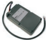
PS224 24 Vdc battery back-up.