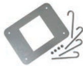
XBA16 Anchorage base with clamps.